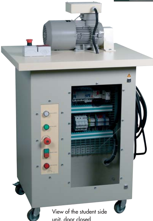
View of the student side unit, door closed