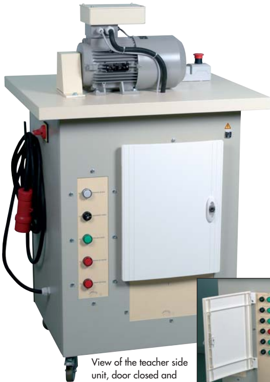
View of the teacher side unit, door closed and open.

Instructions devised by teachers to enable rapid product implementation and the creation of tutorials in the spirit of industrial fault finding.